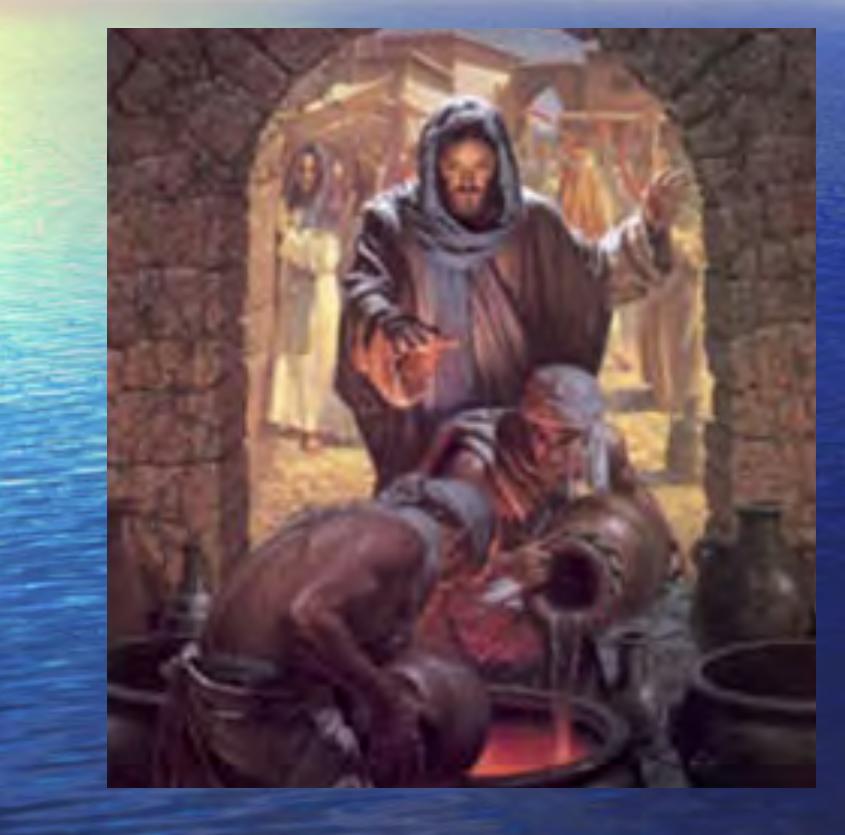
Fig tree withered (21,11,__) Catch of fish (_,_,5) Water to wine (John 2) Another catch of fish (John 21) Total: ~10 narrated